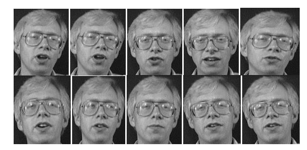
Fig. 5.1 Sample Images of ORL Data Set